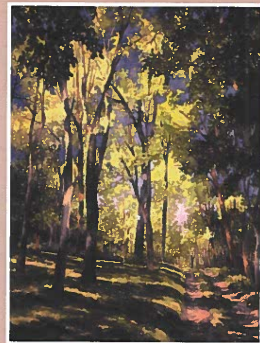
Watercolor by Kesra Hoffman, used with permission

A Program of the Middletown Sustainability Committee