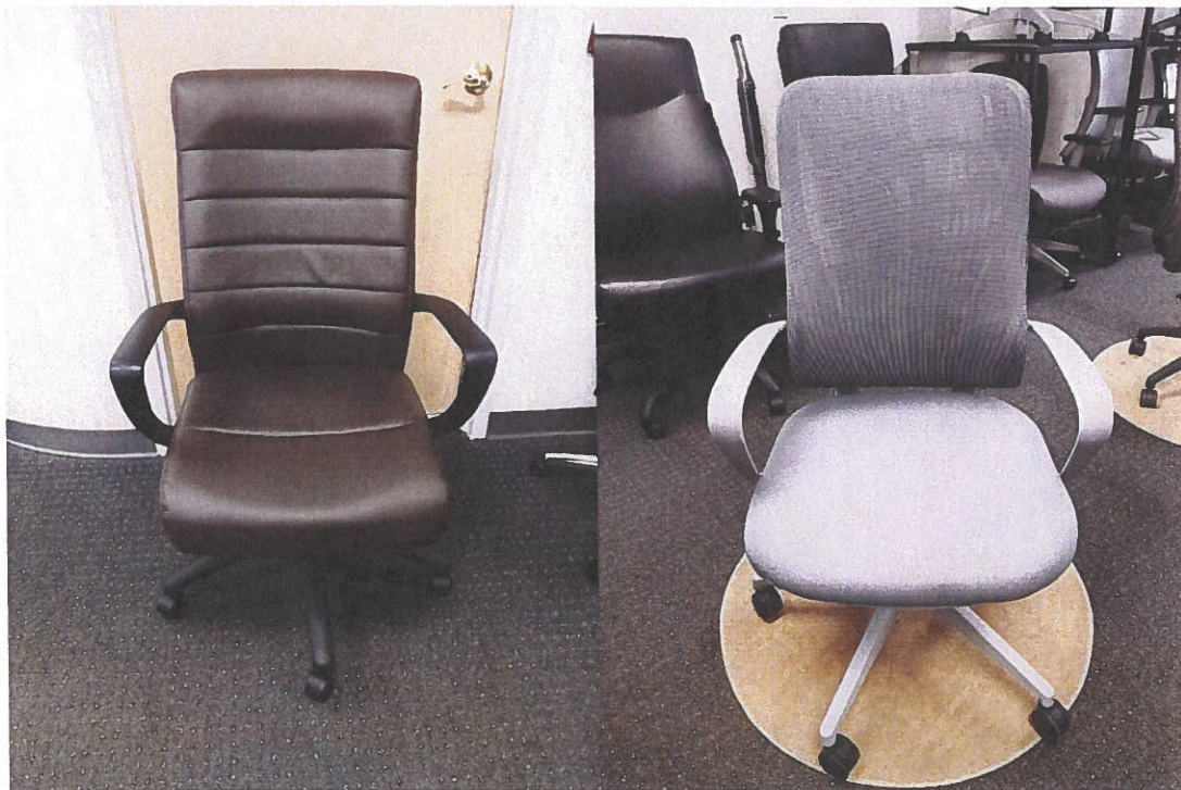
Manchester High back $494