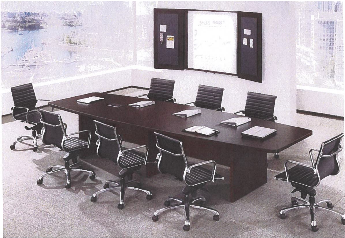
Boat Shaped Conference Table $1,400