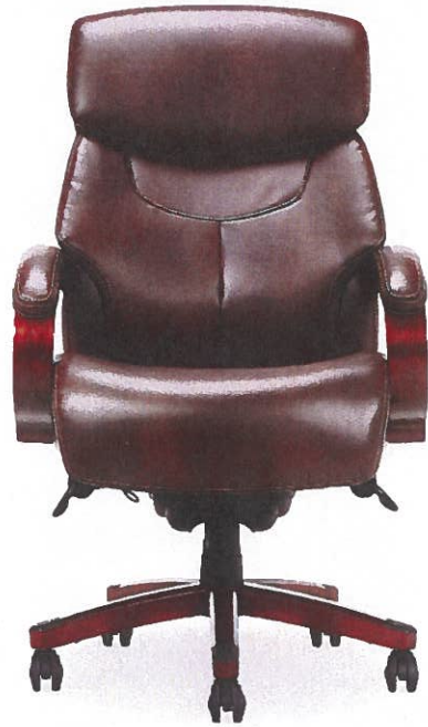
Lazy Boy $319